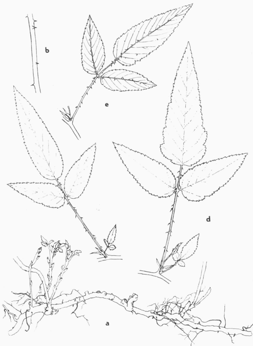
Fig. 1. — Rubus xanthocarpus BUREAU et FRANCH. a — underground portion of the plant with young shoots in early spring; b — stem with prickles; c — typical stem-leaf of mature plant; d — leaf with a terminal leaflet somewhat lobate near the base; e — veins armed with prickles on the underside of a leaflet. Del. Z. Hroudová.

ripe fruit. Petals 10-12 \times 4-6.5 mm, white even in buds, and finely pubescent on both sides, obovate to oblong spatulate, gradually tapering to a short claw (1—2.5 mm long), somewhat exceeding the sepals, entire, spaced at the time of full flowering. Stamens white, a little longer than the greenish styles, numerous, erect; filaments somewhat thick and flattened; anthers